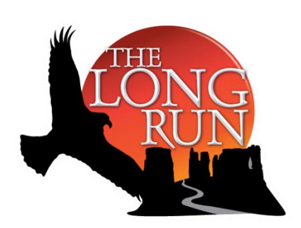
"COLORADO'S TRIBUTE TO THE EAGLES"

The Long Run continues 13 years later, faithfully recreating the 70's sound of America's best-selling rock band in history.